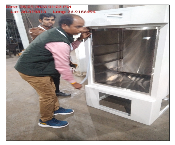
Quality Check Process