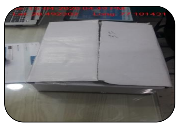
Safe Packaging for Defect Free Delivery of Products