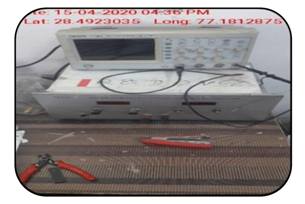
Critical Machine for Production