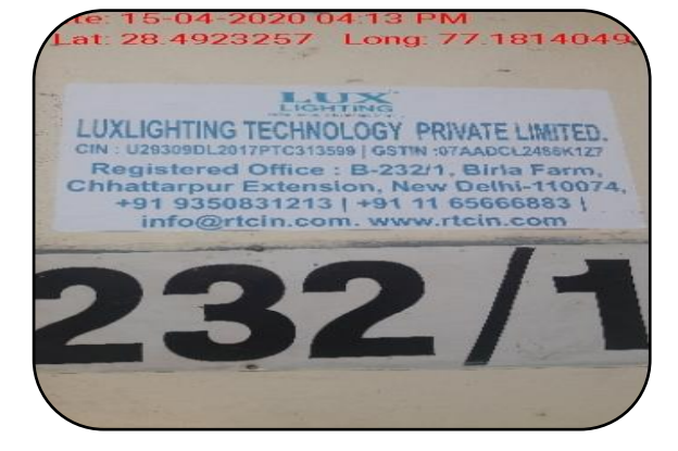
Physical Location: Outside of the Firm