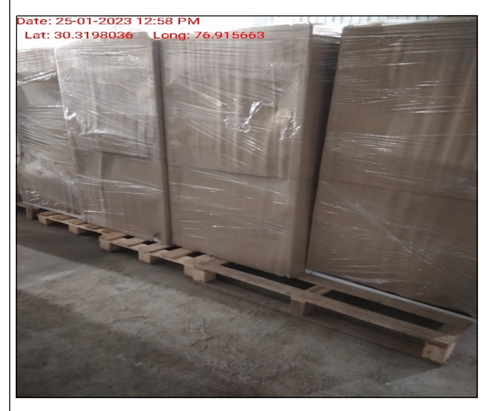
Safe Packaging for Defect Free Delivery of Products