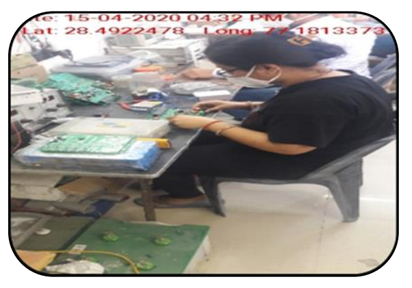
Physical Location: Inside of the Firm