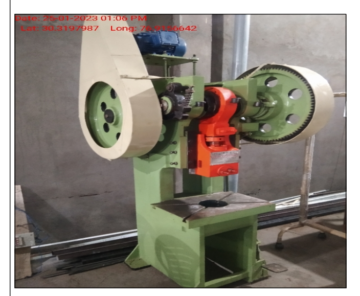
Critical Machine for Production