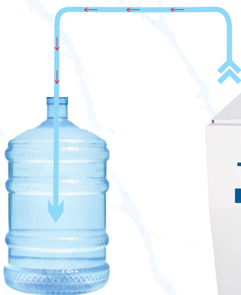
Waste Water Reservoir